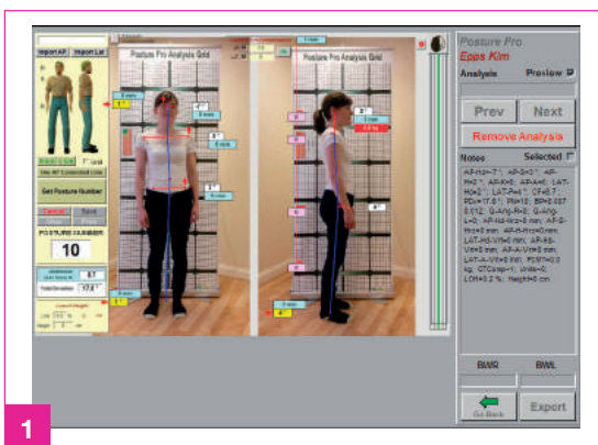
Fig. 1: Picture Pro Analysis on K before EMMETT Treatment