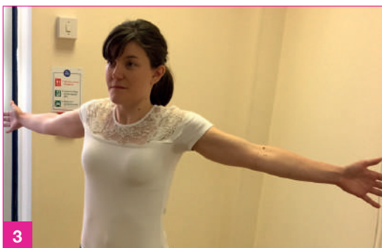
Fig. 3: K performing pec minor test before after EMMETT Treatment