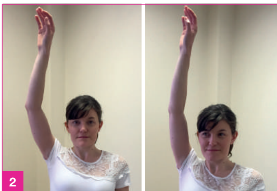
Fig. 2: Arm raise before (left) and after EMMETT Treatment.